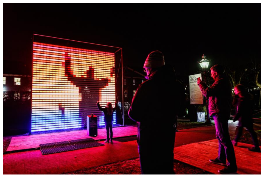
(Copyright Bart Heemskerk / Light Art Collection)

Picto Sender Machine transports the visitor back in time, when there was no such thing as "high definition." The installation consists of an enormous low-resolution screen of 1200 enlarged pixels and invites people to record a short video message. But you can't use words to express your message; only your silhouette, dance steps, and gestures will be translated into blocks of light, displayed live on the screen. Picto Sender Machine forces you to express yourself in the simplest way, without thinking about it too much.