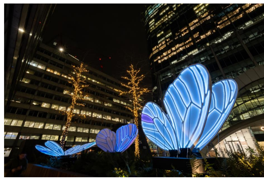
(Image by Noah Goodrich, IlluminoCity 2022, Citypoint, Brookfield Properties)