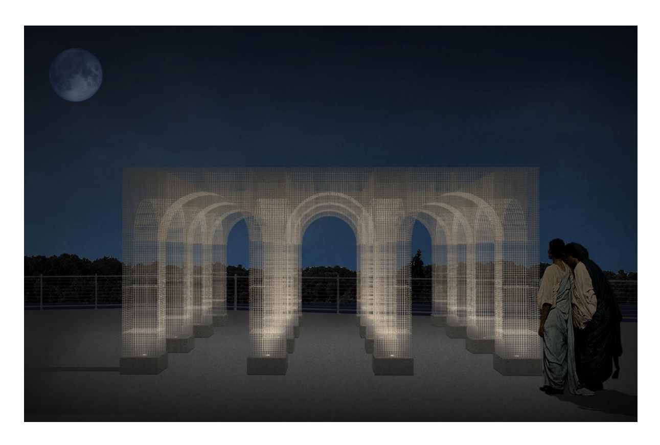
The Beginning of Everything, Nara Park, Washington, DC

Location: Washington Harbour (3000 K St NW)