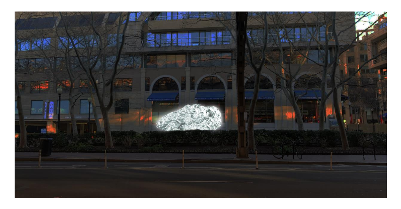
The Wishes Within , Curated Creative, Milwaukee, Wisconsin Location: Georgetown Lutheran Church (1556 Wisconsin Ave, NW)

The Wishes Within celebrates the uplifting energy of hope and the delights of dreams. As the world faces an uncertain future, it can be easy to fall into thoughts of fear, worry, and anxiety. Now it's more important than ever to keep hope alive. One of the world's most beautiful traditions addressing the negative aspects of life centers around sky lanterns. Rooted in Asian culture, the practice of lighting sky lanterns has been celebrated across the world as a practice to release worry and embrace hope. In this moment of pause created by the pandemic, we have faced fears - but also been offered time for introspection and reflection to discover what matters most. In this interactive installation, viewers are encouraged to hold a wish in their heart and step inside the marked circle to bring their wish to life. Wishes are the seeds that grow and make the world a better place. Experience this magic and release your wish to the world. Tag your posts with #thewisheswithin to share your wish with the artists!